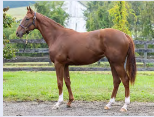
Blofeld - E Dubai's Humor filly Hip #167