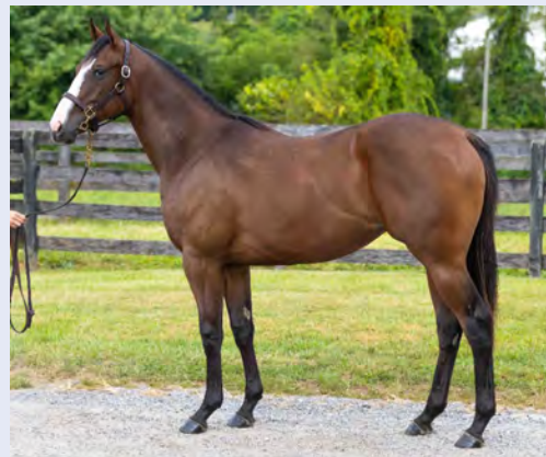
Omaha Beach - Maybe I Will filly Hip #222