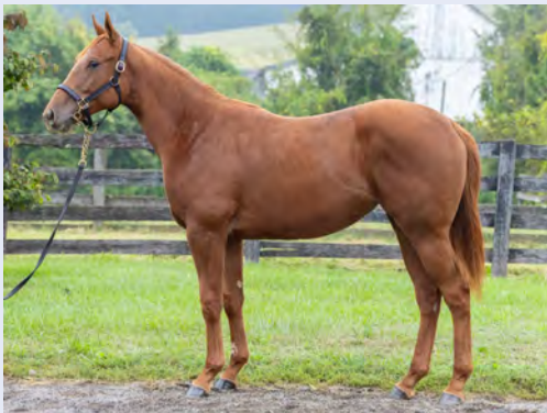
Vekoma - Lunar Rille filly Hip #22

Come with the Country Life team as we inspect the offerings for our next crop of stakes winners. From this sale in recent years, we have selected black-type winners Virginia Beach and Galilei, and recent allowance winners Amie's Symphony and Divine Works.