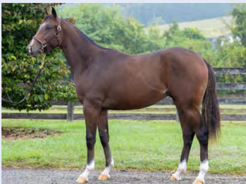
Known Agenda - Moon Vision colt Hip #34