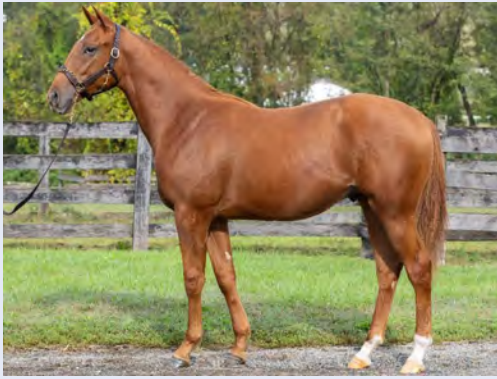
Cyberknife - Starr of Quality colt Hip #86