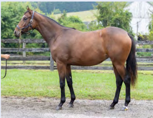
Greatest Honour - Hot Fun filly Hip #206