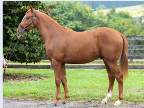
Greatest Honour - Missy Rules colt Hip #31