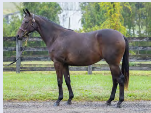
Mosler - So Far Away filly Hip #79