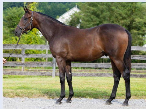
McKinzie - War Value colt Hip #2646 - Sells Tuesday, 9/16