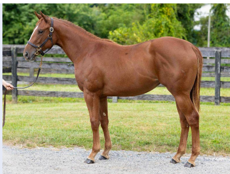
Practical Joke - Jennemily filly Hip #3684 - Sells Thursday, 9/18