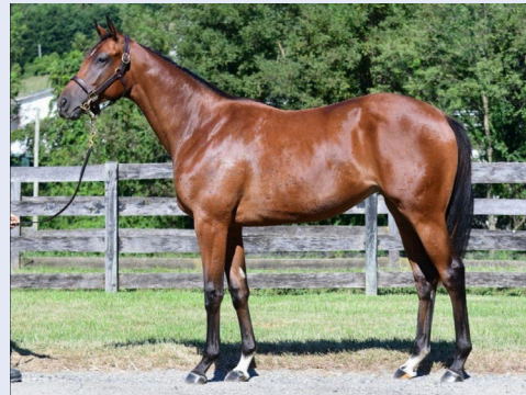
Mandaloun - Make Amends filly Hip #2461 - Sells Tuesday 9/16