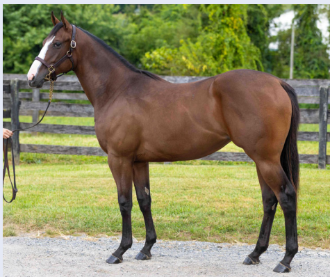
Omaha Beach - Maybe I Will filly Hip #2468 - Sells Tuesday, 9/16