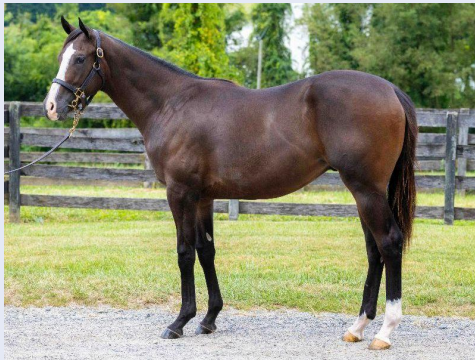
Olympiad - Kenda colt Hip #776 - Sells Thursday, 9/11