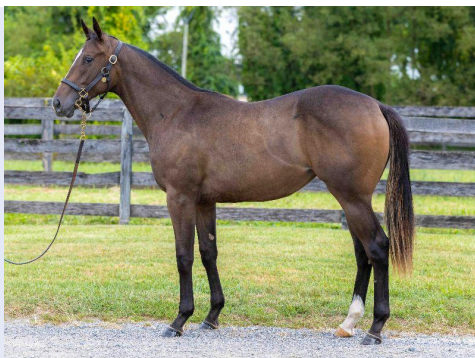
Authentic - In It For the Gold filly Hip #3676 - Sells Thursday, 9/18