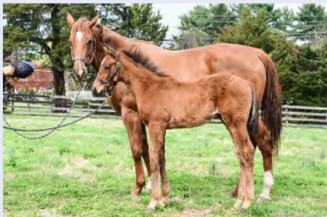
Fifteen Royals and her Maximus Mischief colt