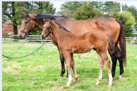
Maybe I Will and her Bolt d'Oro colt