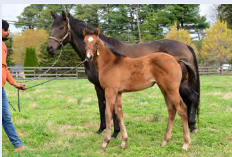
Miss Nondescript and her Mandaloun filly

March Foals (click on picture for link to gallery)