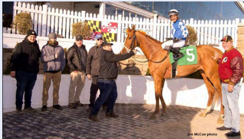
Stickwiththecolors, by Divining Rod