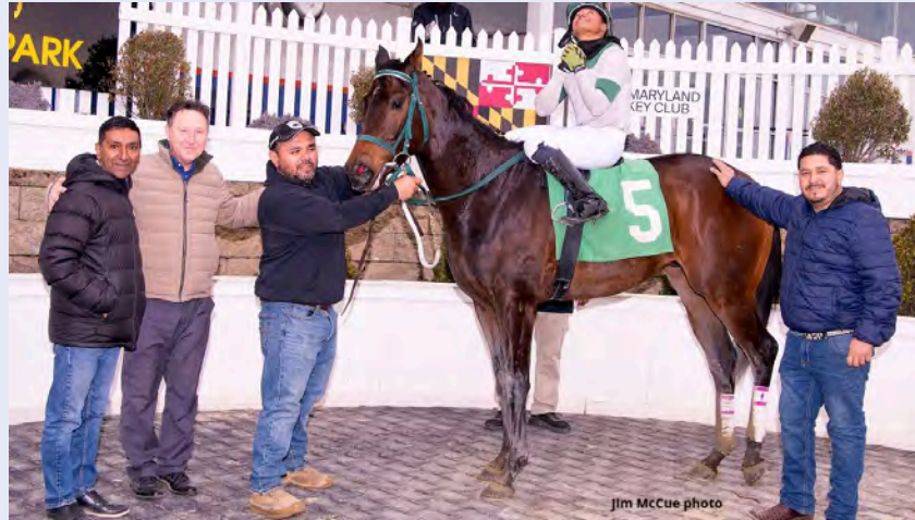
Sir Chance a Lot, by Mosler