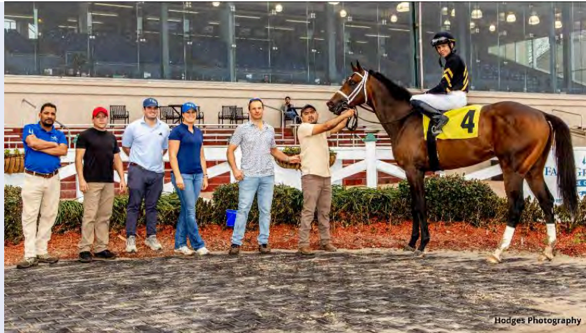
Passion Rules, by Friesan Fire

Check out our farm YouTube Channel for stallion videos, training videos and more!