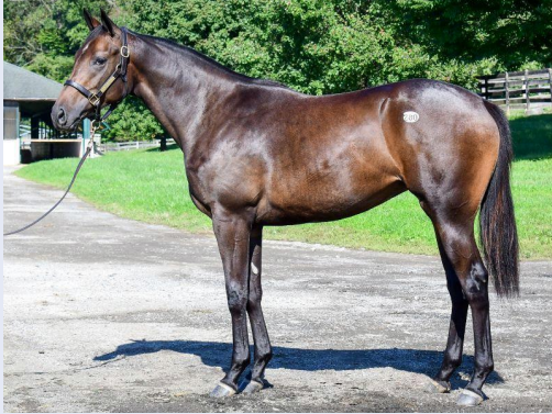
NYQUIST - HOKEY OKEY