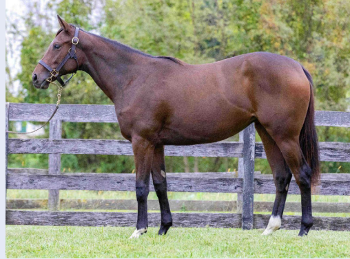
DIVINING ROD - FIFTEEN ROYALS

Amidst the excitement surrounding this weekend's Maryland Million event and next month's Breeders' Cup races, partners hopped into two new Country Life filly racing partnerships from Fasig-Tipton's Midlantic Fall sale on Oct. 1.