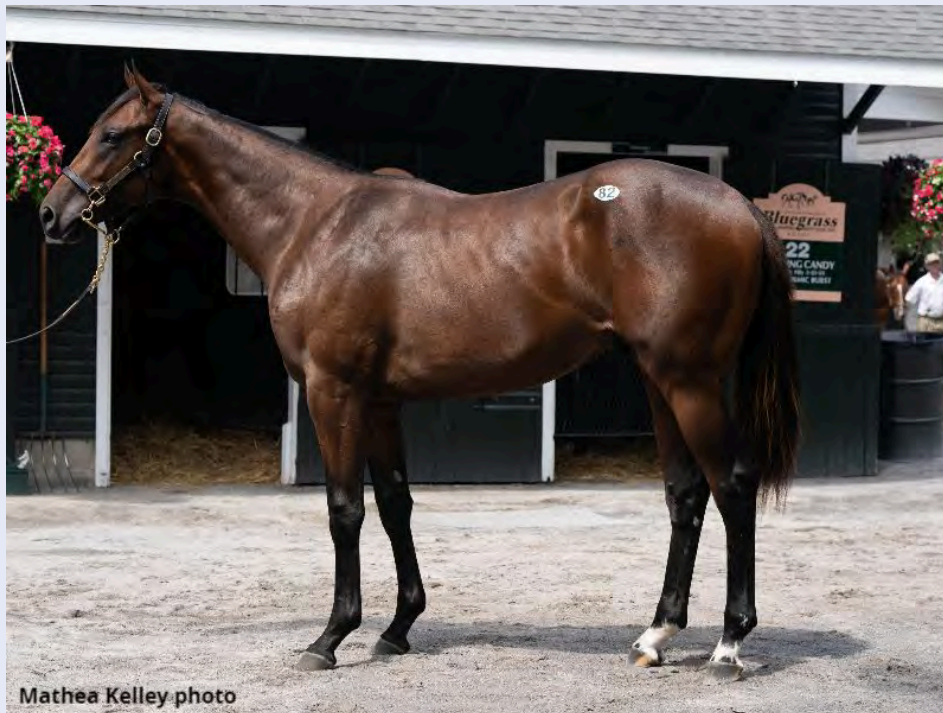
Yaupon - Make Amends colt