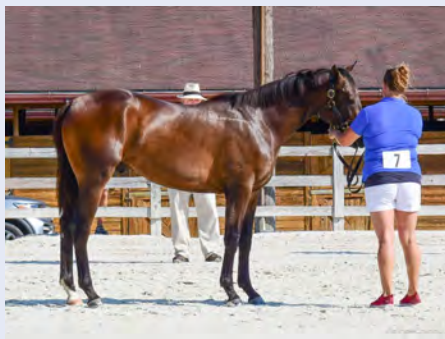
Divining Rod-Miss Nondescript colt placed 2nd in his class for MD-sired/MD-bred colts.

We also made waves showing a rare Palomino thoroughbred filly named Divine d'Or, by Divining Rod, who was a hit with spectators. The annual Yearling Show continues its importance on the Maryland calendar as a gathering place for the stalwart breeders of Maryland foals. It is also an excellent schooling experience for these yearlings as they begin prepping for the fall sales. Look for a number of these quality Maryland-bred yearlings to be offered at the Fasig-Tipton Midlantic Yearling Sale in Timonium on Sept. 30 and Oct. 1.