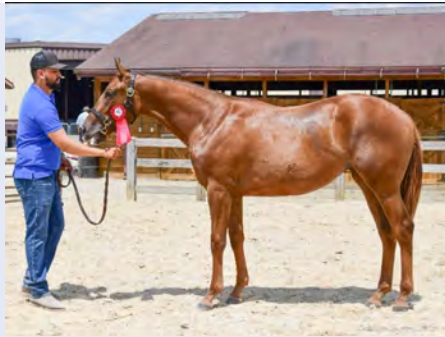
The Known Agenda-War Value filly placed 2nd in her class for out-of-state sired MD-bred fillies.