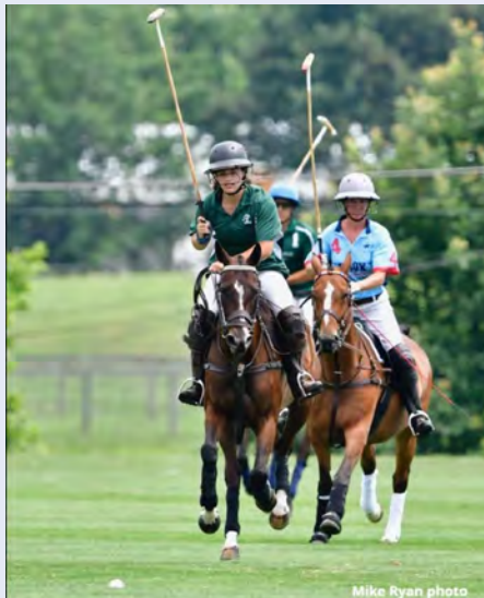
Former partnership filly Dixie Divine (leading) is finding her niche on the polo field.