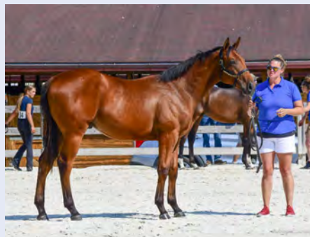
Bolt d'Oro-Lunar Rille colt earned 2nd place in the out-of-state sired MD-bred colts class.