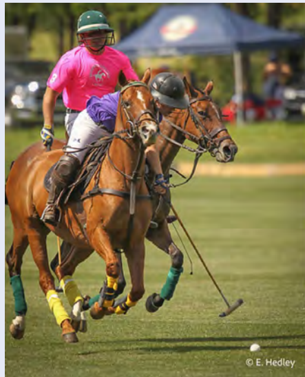
No longer a broodmare, Scarfire (chestnut in front) has become a top polo pony.

In the past few years, we've re-homed many off-track Thoroughbreds to second careers as riding or show horses. However, the safe landing route is harder on Thoroughbreds who are small-sized. One discipline that loves small horses is polo.