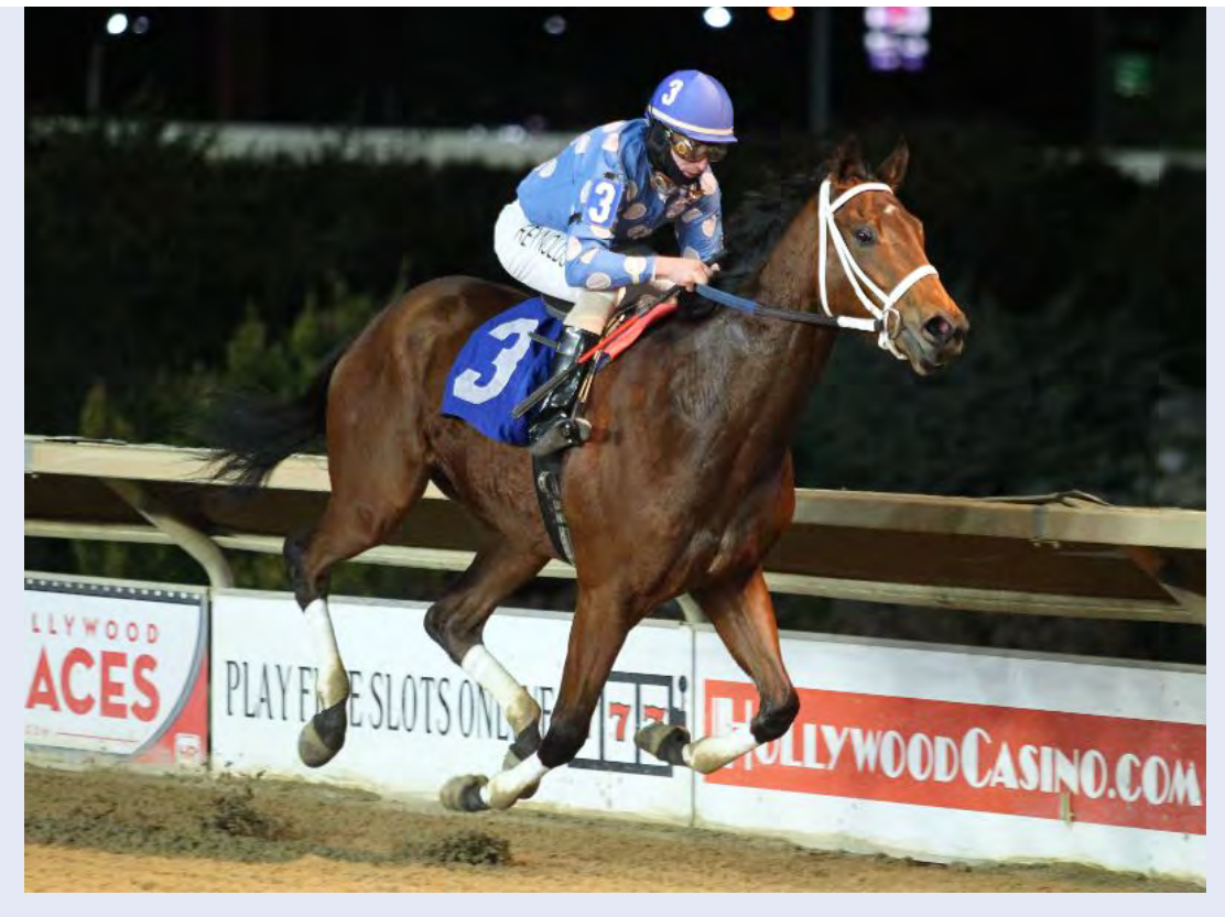
Judgement Day, by Divining Rod Coady Photo