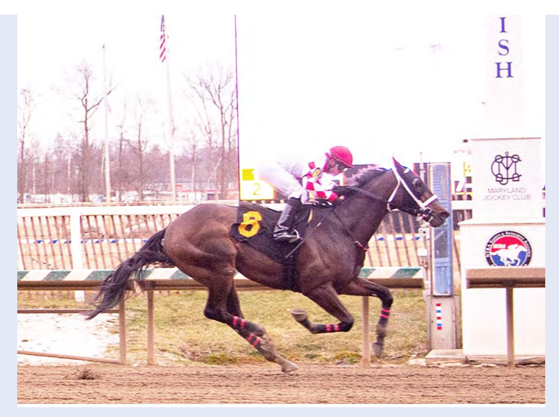
Mosler Tme, by Mosler