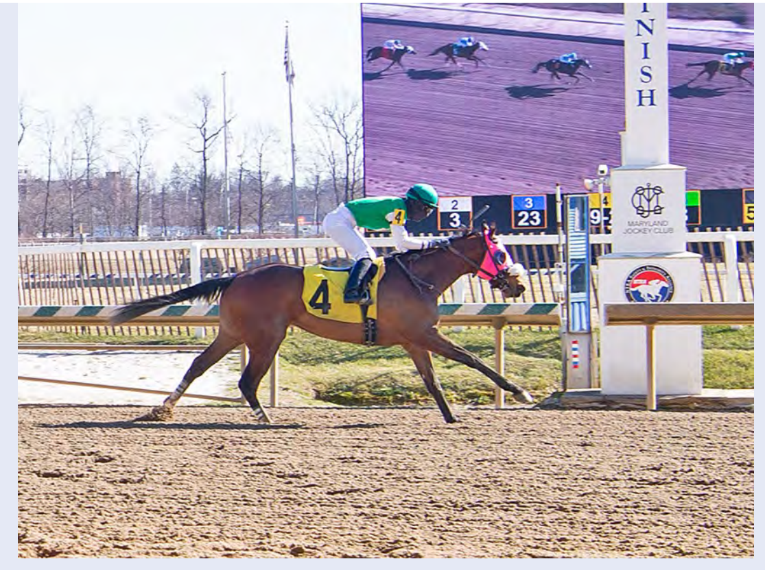
Sheherhers, bred by Country Life Farm & Basedonatruestory LLC