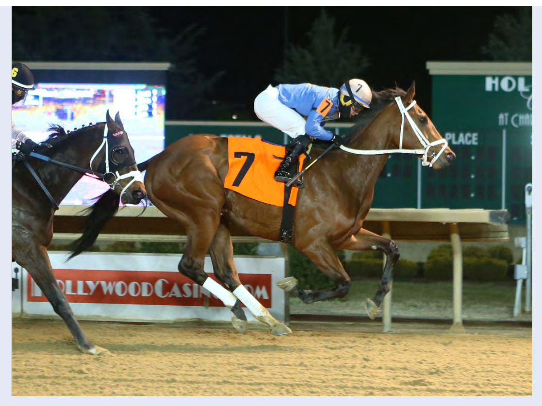
Naughty Streak, by Friesan Fire