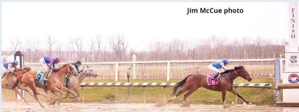
Bay Street, by Mosler