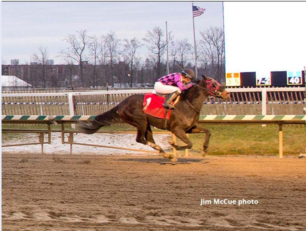
Next Girl, by Divining Rod