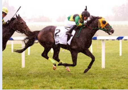
Wicked Prankster, by Mosler, takes the $125,000 MD Million Turf Stakes for the 2nd year in a row.

Maryland Million Day was a success for Country Life sires, both present and past. Divining Rod and Mosler got stakes winners on the day, and former CLF stallions Freedom Child and Super Ninety Nine sired the exacta in the feature race of the day, the $150,000 MD Million Classic.