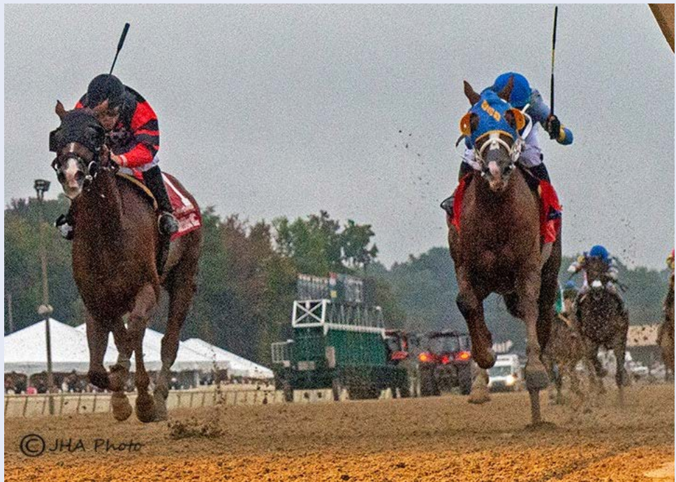
Ain't Da Beer Cold (inside), by Freedom Child, wins the $150,000 MD Million Classic after a disqualification of Market Maven, by Super Ninety Nine.