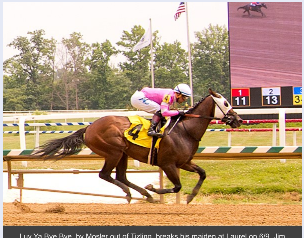
Luv Ya Bye Bye, by Mosler out of Tizling, breaks his maiden at Laurel on 6/9.