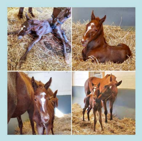
Foaled at Country Life Farm