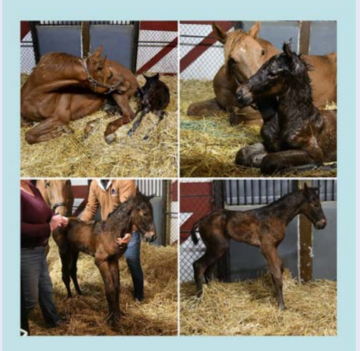
Foaled at Country Life Farm