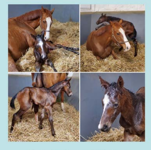
Foaled at Country Life Farm