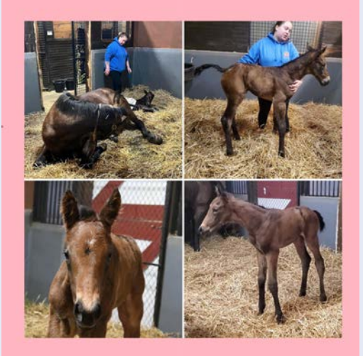
Foaled at Country Life Farm