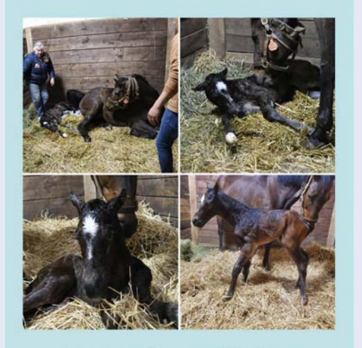
Foaled at Country Life Farm