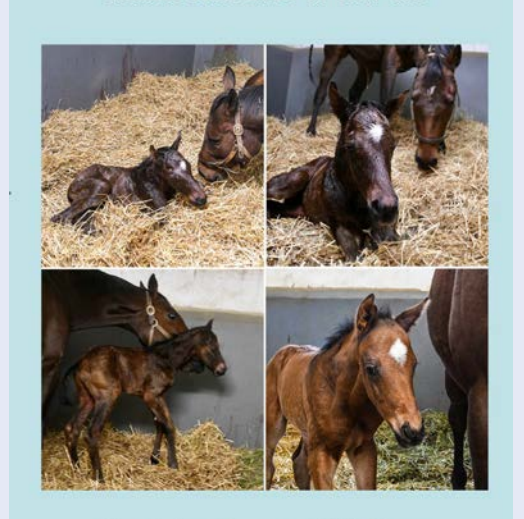
Foaled at Country Life Farm