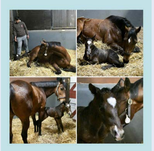
Foaled at Country Life Farm