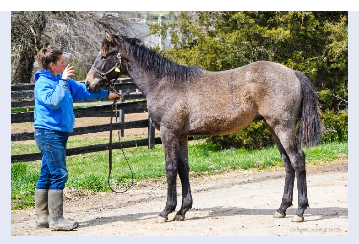
Malibu Moon colt out of Basedonatruestory

Aiming for select sales at Fasig-Tipton and Keeneland, our Breeding Partnerships yearling crop of 2023 is a small but select group.