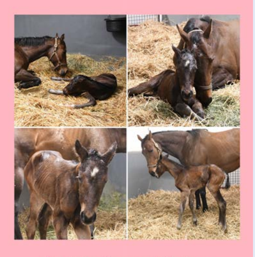
Foaled at Country Life Farm