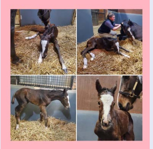
Foaled at Country Life Farm