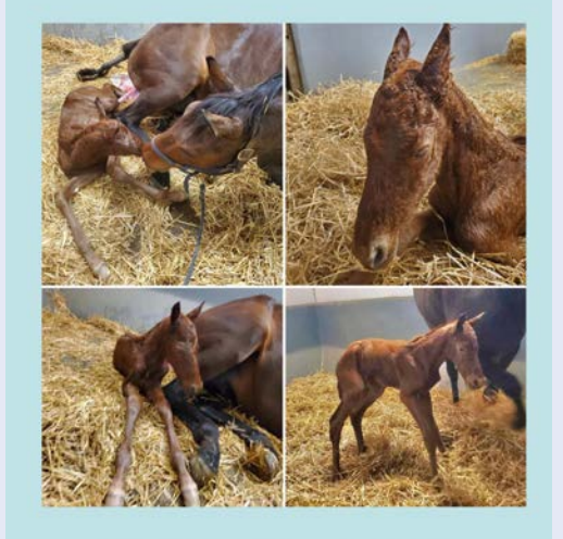
Foaled at Country Life Farm