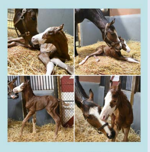
Foaled at Country Life Farm