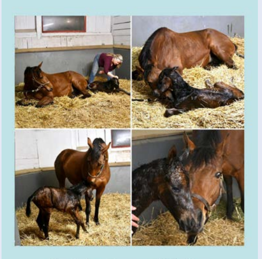
Foaled at Country Life Farm