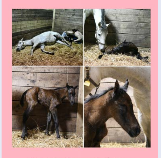
Foaled at Country Life Farm