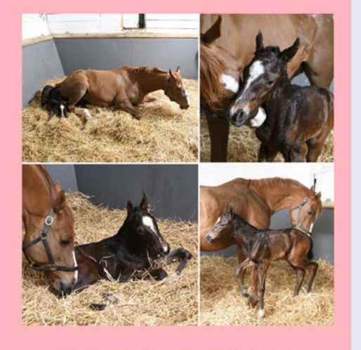
Foaled at Country Life Farm