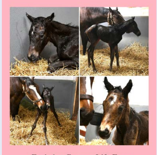
Foaled at Country Life Farm