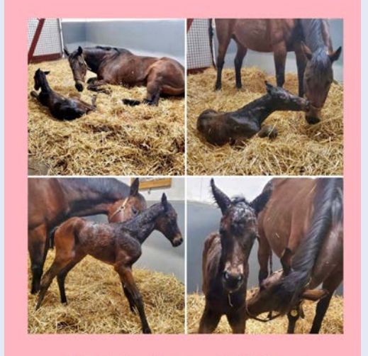
Foaled at Country Life Farm