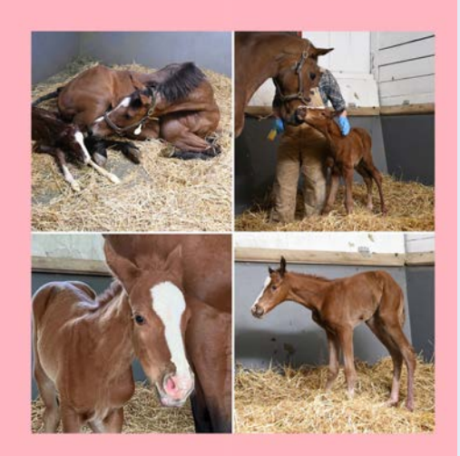
Foaled at Country Life Farm