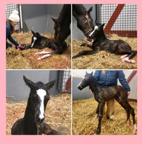
Foaled at Country Life Farm