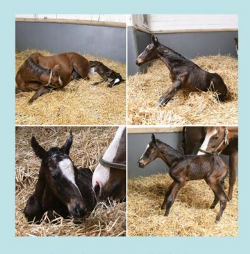
Foaled at Country Life Farm