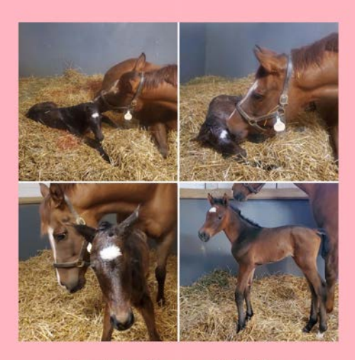
Foaled at Country Life Farm