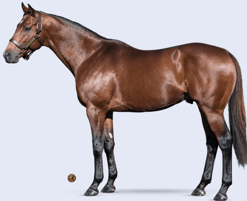
AUDIBLE at Winstar