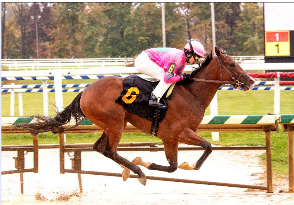
2-year-old Liquidator (Divining Rod) breaks her maiden on 10/13 at Laurel.