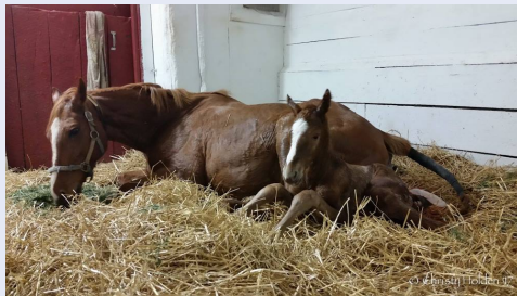
Maryland Million Classic winner

Ournationonparade, as a newborn at Country Life Farm, February 2018