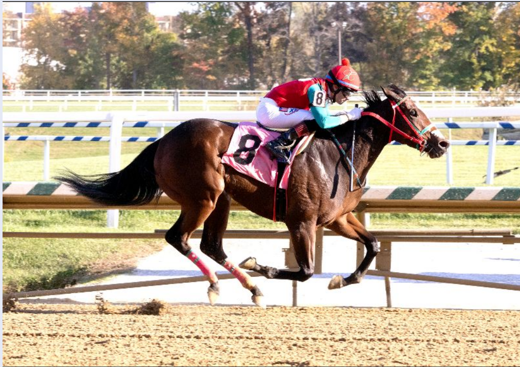
Bandits Warrior wins Allowance at Laurel on 10/21 for her 3rd lifetime victory.