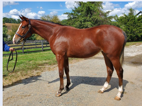
Hip 374 - filly