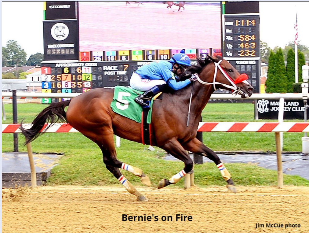
Bernie's on Fire