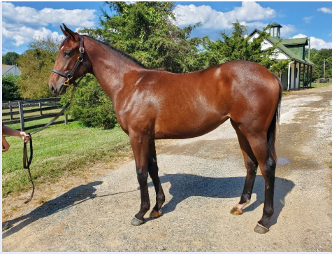
Hip 378 - filly Mosler - Lady Krista