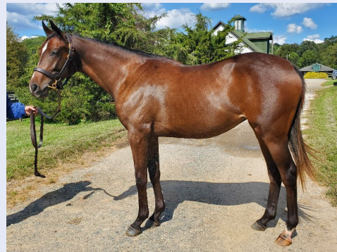
Hip 45 - filly Divining Rod - So Far Away