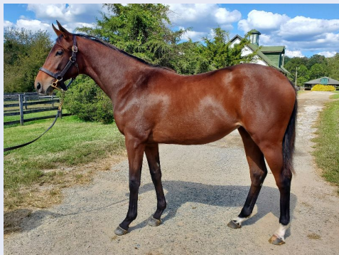
Hip 180 - filly

** Click links or pictures below to see catalog pages