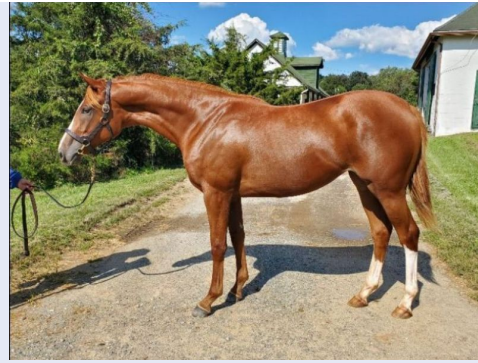
Hip 421 - filly Catholic Boy - Miss Mystique