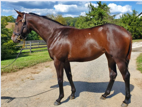
Hip 510 - filly Mosler - Rotate