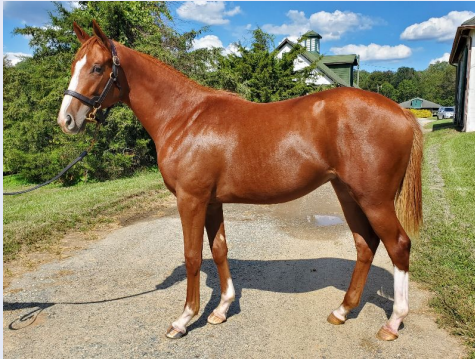
Hip 422 - filly Divining Rod - Missy Rules