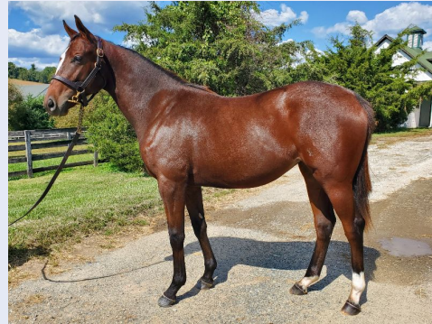
Hip 477 - filly Twirling Candy - Playful Love