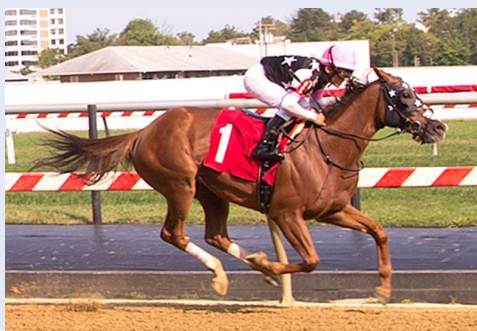
Targe gets her 3rd lifetime win at Pimlico on 9/17.