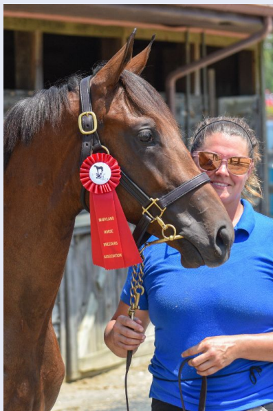
Mosler - Fifteen Moons filly was 2nd in her class for MD-sired fillies. Owned and bred by CLF & Fifteen

In addition to the four that received ribbons (pictured above), several other fillies made the final cut in their class. All of the yearlings showed well, behaved perfectly and got home safely which is a major win for the day. They are all now eligible for the $40,000 MHBA Yearling Show Premium, which is split and distributed twice ($20,000 divided among the four show contestants who earn the most money as 2-year-olds during 2023 and $20,000 divided among the four highest earning 3-year-olds the following year).