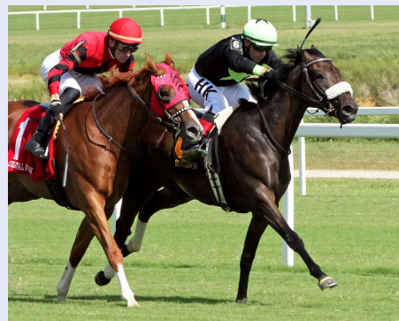
2-year-old Next Episode (Mosler) scores in her second start at Colonial on 8/30.