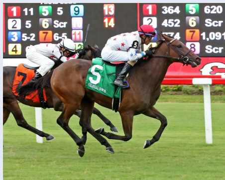
2-year-old Flamingo Faze (Mosler) wins on debut at Colonial on 8/15.