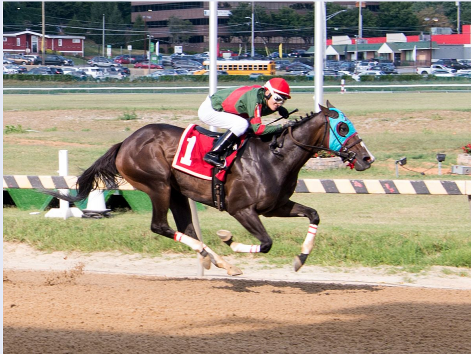
Hot Spice (Mosler) maiden win at Timonium on 8/27.