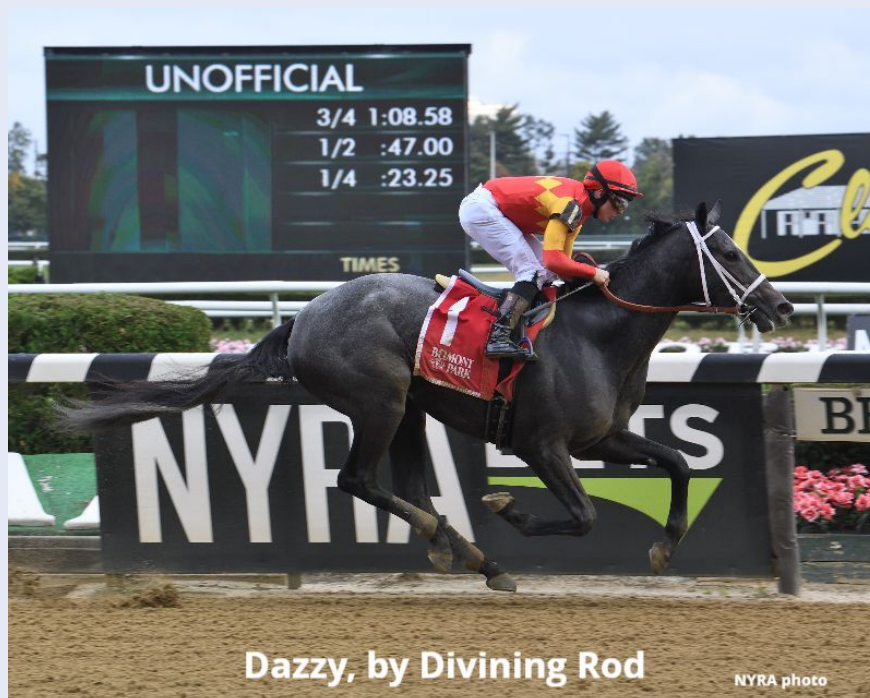
Dazzy, by Divining Rod

In New York, Country Life's Freshman stallion DIVINING ROD sires 12-length Maiden Special Weight debut winner at Belmont Park, while in Kentucky, Country Life acquires $100,000 Gun Runner Yearling Filly out of mare by Malibu Moon for our LLC's.