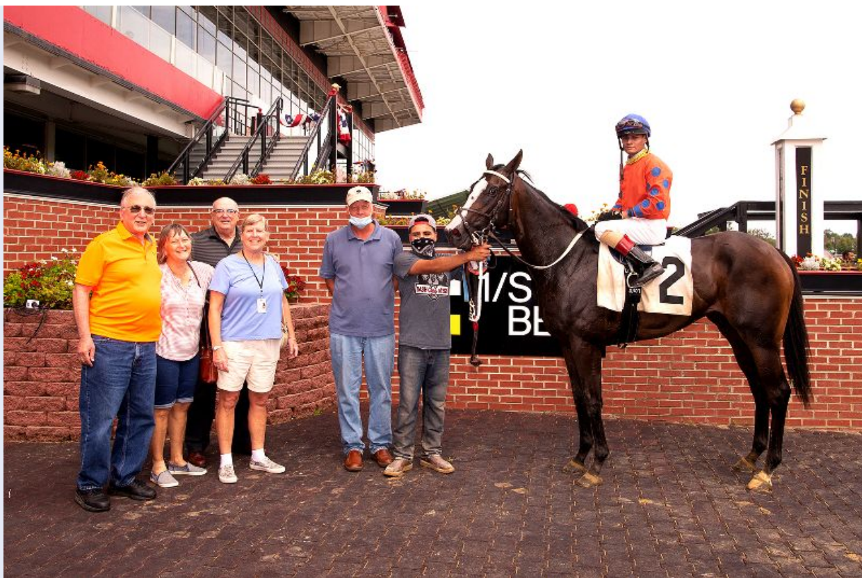
Mosler's Image