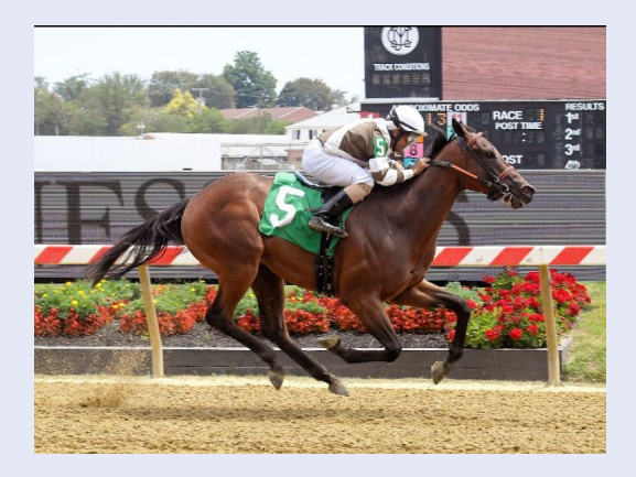
Local Motive drew off to win by 4-1/4 lengths in his first start at Pimlico on 7/24