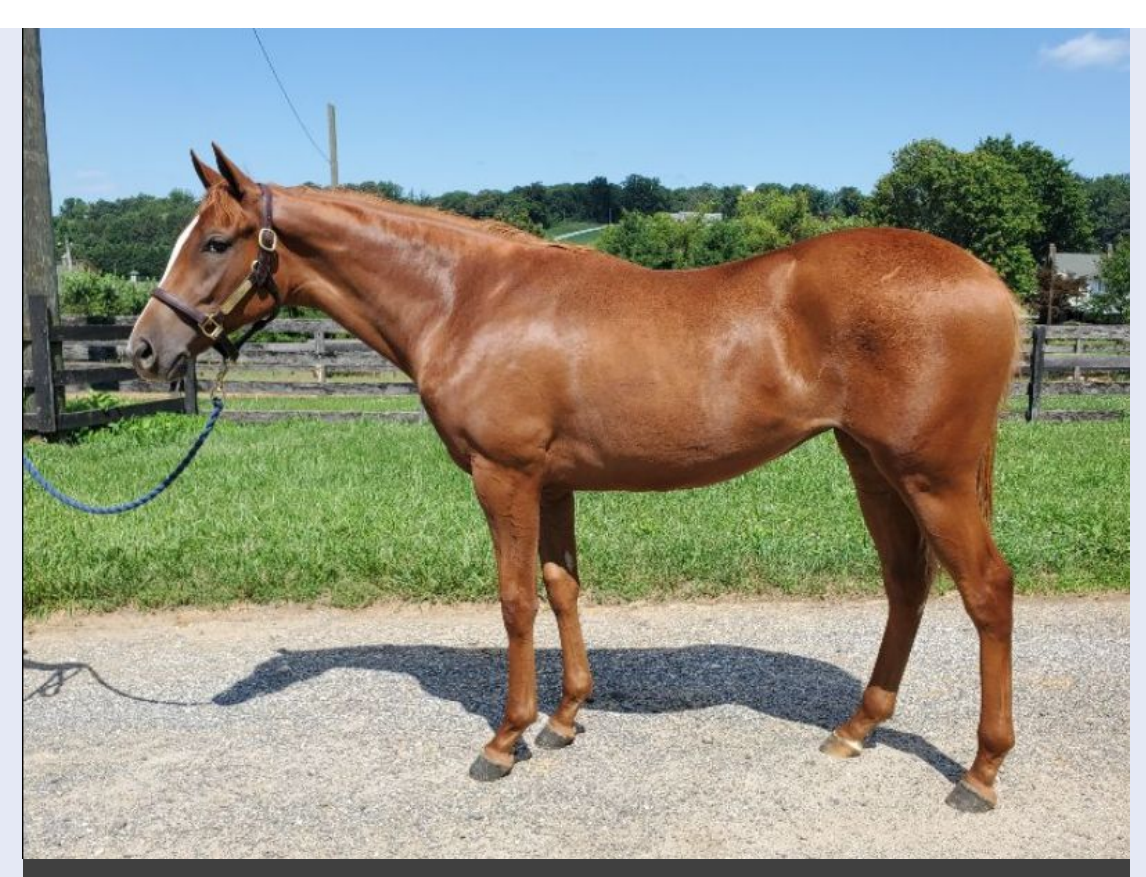
Hip #73 - $40,000 Collected - Secret Kitten filly $4,000/share