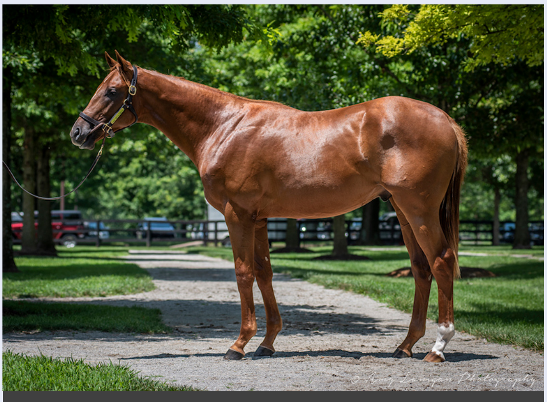
Hip #241 - $90,000 Malibu Moon - Occasionally colt $9,000/share