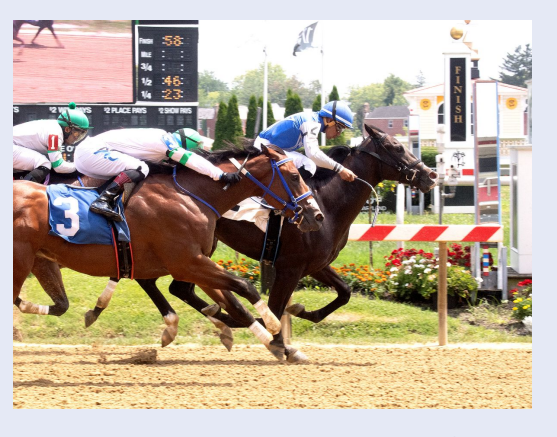
Mr. Mox went wire-to-wire at first asking in MSW at Pimlico on 7/11