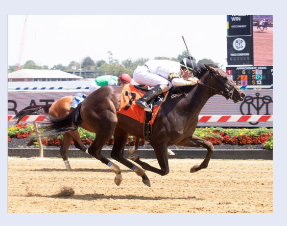
Petition Prayer was his first filly to win, scoring in a MSW at Pimlico on 7/30