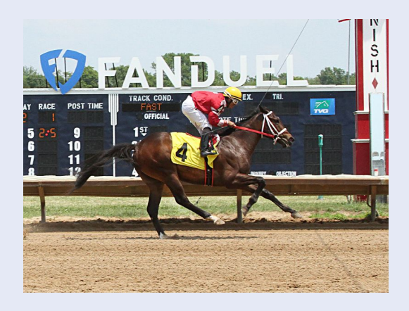
Carnaval Conquest led from start to finish on debut in MSW at Fanduel Horse Racing & Sportsbook on 7/6