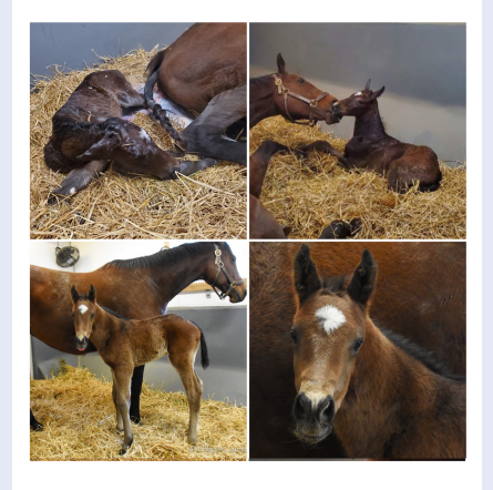
Country Life Farm

Swimmer -Force The Pass Colt Foaled: February 14, 2021 at 10:21 pm