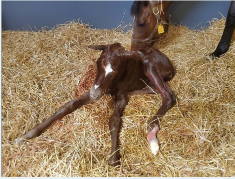
Maid of Cotton filly by Divining Rod, foaled 6/1; owned by Country Life Farm