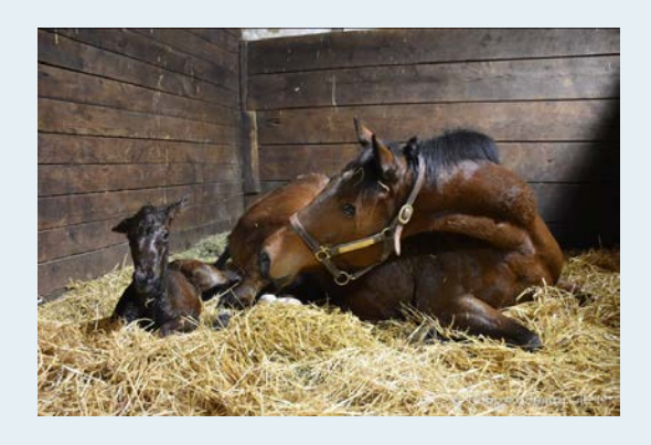
Will Do filly by Friesan Fire, foaled 1/19; owned by Bell Gable Stable