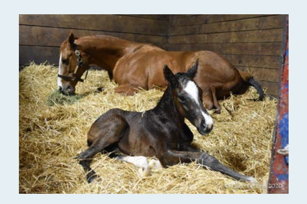
Grecian Maiden filly by Divining Rod, foaled 1/22; owned by CLF/Grecian Maiden II LLC