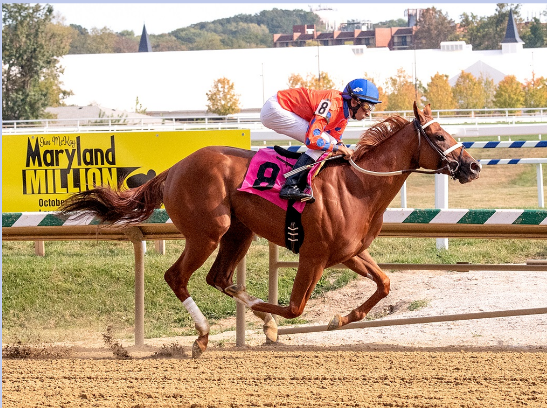
Country Life and the Fifteen Moons Broodmare LLC are the breeders of Fifteen Royals, by Palace Malice, [pictured winning at first asking on Sept. 28 at Laurel.