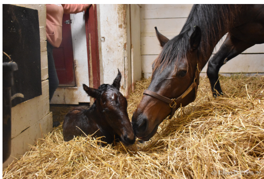
Union Waters colt by Jimmy Creed, foaled 5/13; owned by CLF & Union Waters LLC.