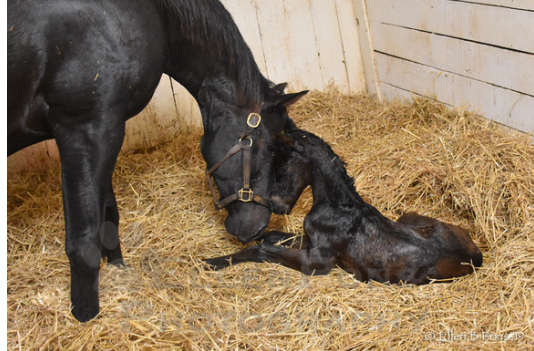
Liberty Road colt by Divining Rod, foaled 5/2; owned by Gainesway Farm