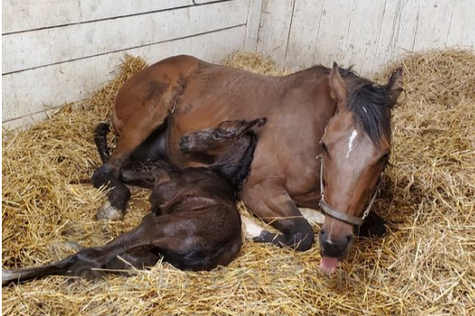
Heart Seeker colt by Holy Boss, foaled 5/2; owned by Candyland Farm.

(click on pictures for links to more photos)