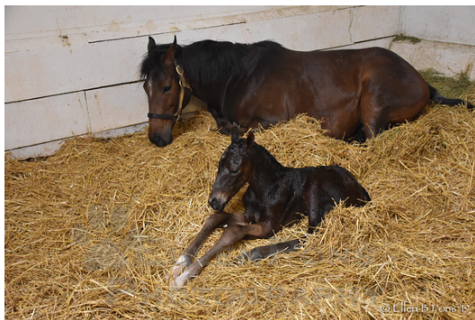
Rue de Rivoli colt by Twirling Candy, foaled 5/11; owned by CLF & Rue de Rivoli LLC