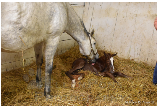
Gravitar filly by Divining Rod, foaled 5/13; owned by Gainesway Farm.