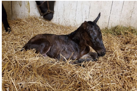
Written Request filly by Divining Rod, foaled 5/5; owned by Gainesway Farm.