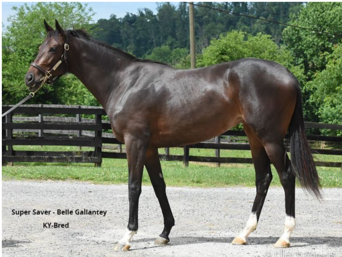
Super Saver - Belle Gallantey KY-Bred