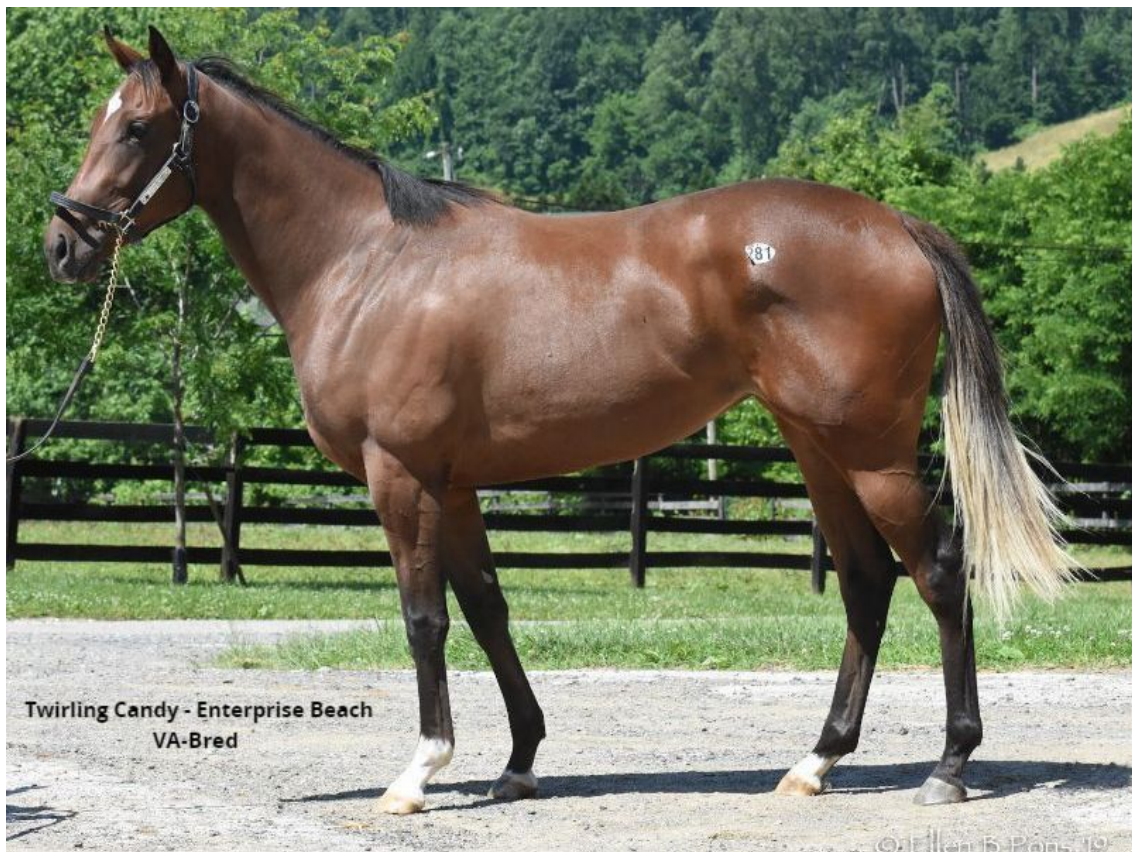
Twirling Candy - Enterprise Beach VA-Bred