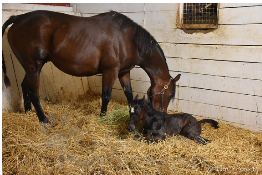
Lawless Love colt by Divining Rod, foaled 5/8; owned by CLF & Lawless Love LLC.