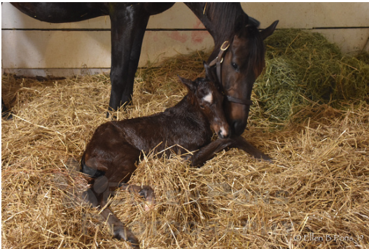
Placentia filly by California Chrome, foaled 5/4; owned by CLF & Placentia LLC