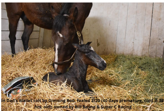
In Dad's Wallet colt by Divining Rod, foaled 2/20 (40 days premature, died @ 36 hrs. old); owned by Bill Payne & Super C Racing