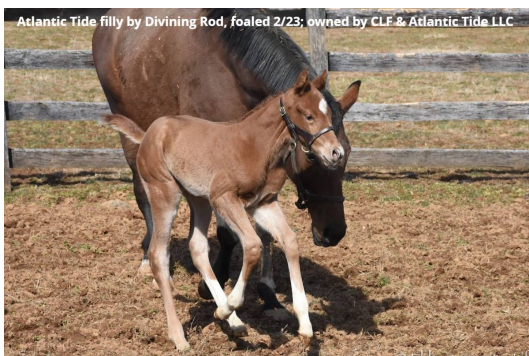
Atlantic Tide filly by Divining Rod, foaled 2/23; owned by CLF & Atlantic Tide LLC