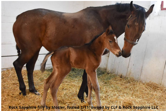
Rock Sapphire filly by Mosler, foaled 2/11; owned by CLF & Rock Sapphire LLC