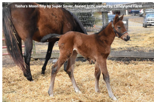
Tasha's Moon filly by Super Saver, foaled 2/25; owned by Candyland Farm