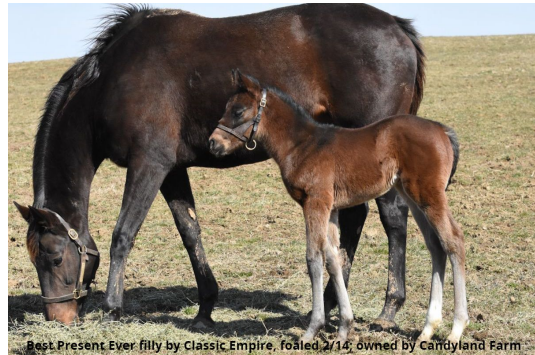
Best Present Ever filly by Classic Empire, foaled 2/14; owned by Candyland Farm