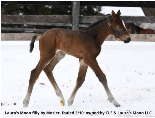
Laura's Moon filly by Mosler, foaled 2/10; owned by CLF & Laura's Moon LLC