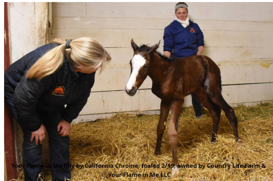
Your Flame in Me filly by California Chrome, foaled 2/19; owned by Country Life Farm & Your Flame in Me LLC