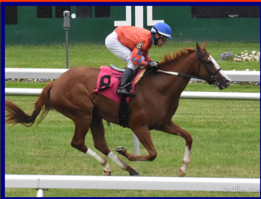
Partnership filly Monte Crista scores another easy victory on the turf.

Every racehorse owner dreams of success, at any level. Just 24 hours after blaze-faced chestnut 3-year-old Justify swept the Triple Crown, the Country Life Racing Partnership team was thrilled when our Justify look-alike Monte Crista, also a beautiful chestnut 3-year-old with a wide-blazed face, swept to her second dominant win in a row.