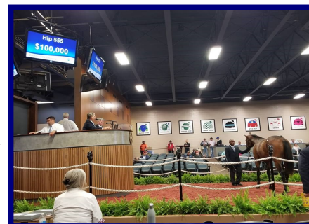
Right: Hip 555, by Super Ninety Nine, brings $100,000