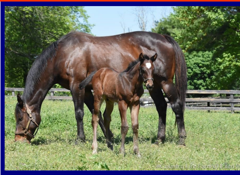
Mosler—Union Waters colt, 5/2. Owned by CLF & Union Waters LLC.