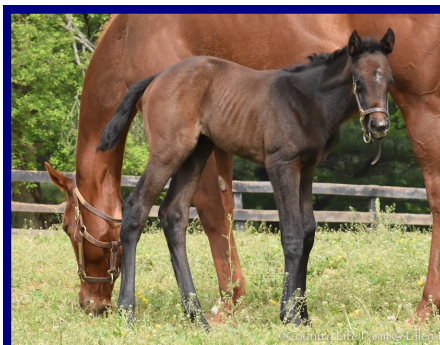
Liam's Map—Apple Pie Baby filly, 5/7. Owned by Candyland Farm.