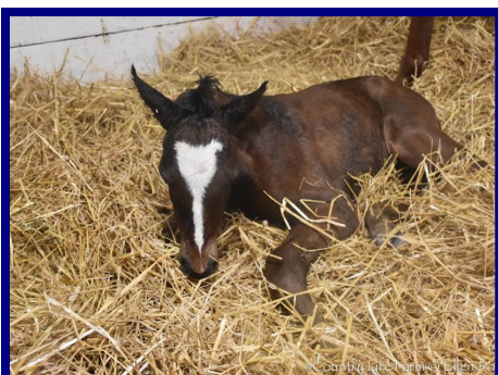
Mosler—Sassy Molly colt, 5/9. Owned by CLF & Sassy Molly LLC.