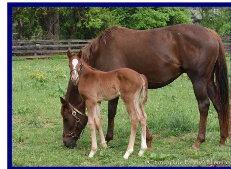
Bourbon Courage—Kohanya filly, 5/9. Owned by Jim Dresher/Glenangus Farm