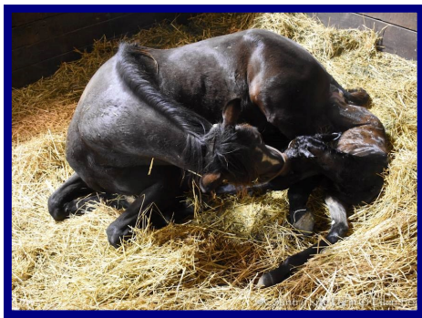
Mosler—Dominus Effect filly, 4/10. Owned by Country Life Farm.