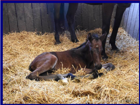
Carpe Diem—Raise Up filly, 4/21. Owned by CLF & Raise Up LLC