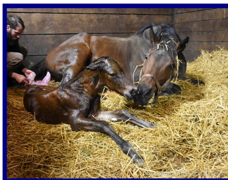
Hit it a Bomb—Courage to Change colt, 4/23. Owned by Country Life Farm