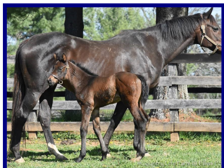
Mosler—Blue Indygo filly, 4/14. Owned by Angelinos Racing LLC