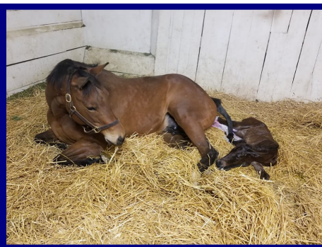
Super Saver—Thievery filly, 4/8. Owned by Gainesway Farm.