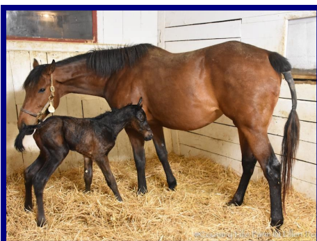
Mosler—Miss Moonshine filly, 4/10. Owned by CLF & Miss Moonshine LLC