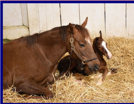
Violence—Heather colt, 4/22. Owned by CLF & Heather LLC