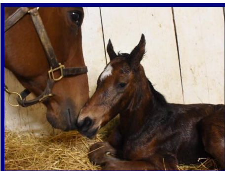
Mosler—Fifteen Moons filly, 4/2. Owned by CLF & Fifteen Moons LLC