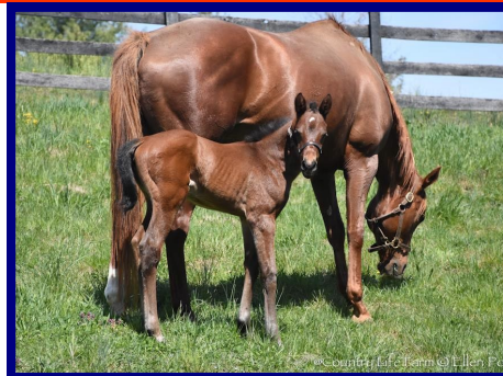
Declaration of War—Miss Pauline filly, 4/15. Owned by CLF & Miss Pauline LLC