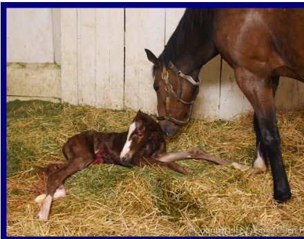
Super Ninety Nine—Moon Map colt, 4/4. Owned by CLF & Moon Map LLC