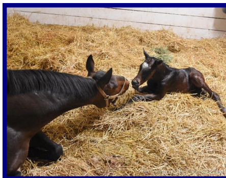
Mosler—Fleet and Fancy filly, 4/29. Owned by CLF & Fleet and Fancy LLC