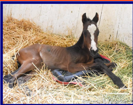
Super Ninety Nine—GG's Dolly filly, 4/1. Owned by Country Life Farm