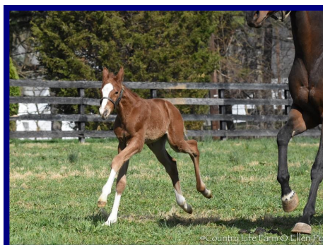
Super Ninety Nine—Maid of Cotton colt, 4/19. Owned by Country Life Farm.