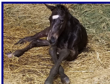
Mosler—Final Humor colt, 4/20. Owned by Country Life Farm.