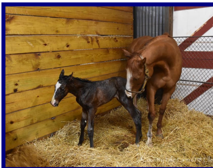
Mosler—Grecian Maiden filly, 4/11. Owned by CLF & Grecian Maiden LLC