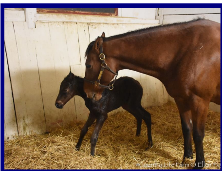
Liam's Map—Missy Rules filly, 4/23. Owned by CLF & Missy Rules LLC