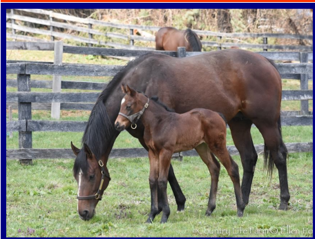
Bayern—Lawless Love filly, 4/1. Owned by CLF & Lawless Love LLC