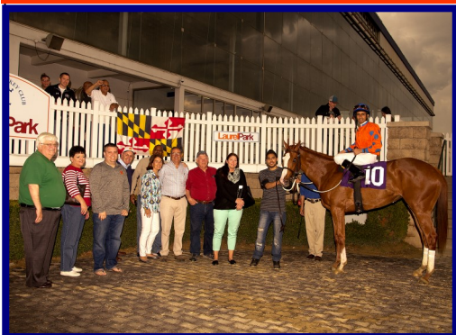
Partners in our Monte Crista LLC gather in the Laurel Winner's Circle after Monte Crista's $42,000 Turf win.