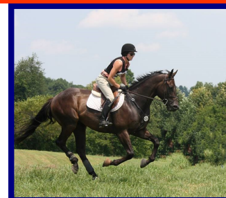
General Lee was a barn favorite and a joy to fox-hunt or ride cross-country.

Foaled at Country Life on Valentine's Day in 2010, he was a lover from the start and will be sorely missed by all who took care of him and got to know him.