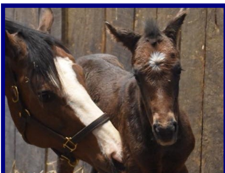
Street Boss—Ann's Smart Dancer filly, 3/28. Owned by CLF/Ann's Smart Dancer LLC