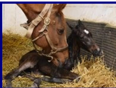
Mosler—Silent Wisper colt, 3/8. Owned by Country Life Farm