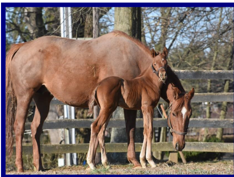
Anchor Down—Simmadownnow filly, 3/14. Owned by CLF/Simmadownnow LLC