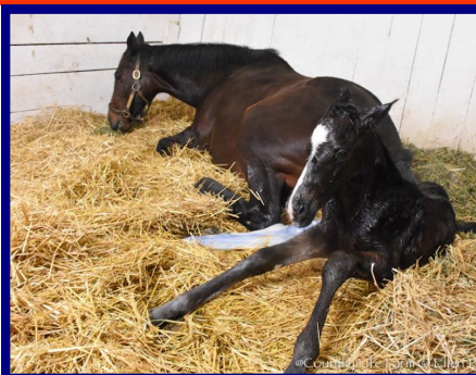
Mosler-European Union colt, 3/1 (died). Owned by CLF & European Union LLC