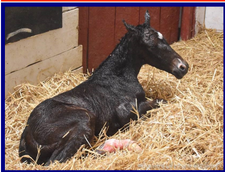
Mosler—Broken Trust Fund colt, 3/21. Owned by CLF & Broken Trust Fund LLC