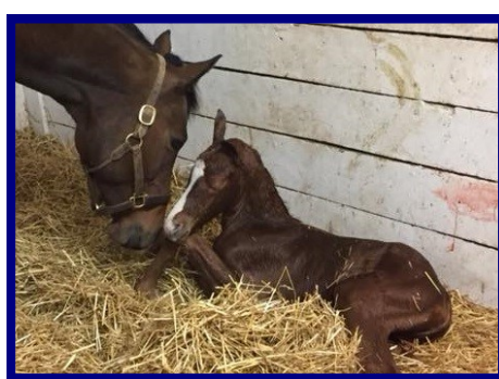
Will Take Charge—Curio filly, 3/26. Owned by CLF & Curio LLC