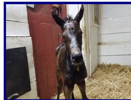
Cinco Charlie-D D Renegade colt, 3/27. Owned by Candyland Farm.