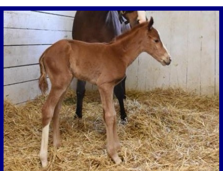
Midshipman-Maryland's Love filly, 3/28. Owned by Walt Vieser