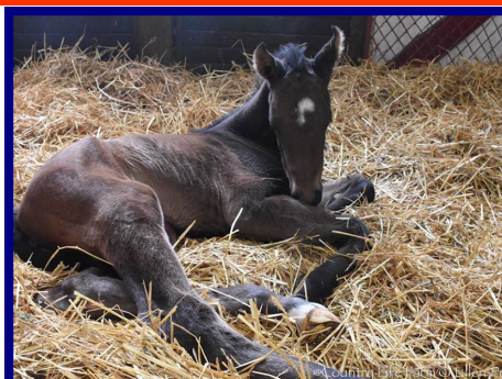
Mosler—Atlantic Tide filly, 3/3. Owned by CLF & Atlantic Tide LLC.