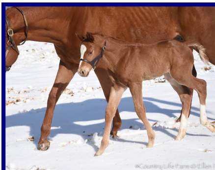
Malibu Moon—Spin the Bottle colt, 3/20. Owned by Candyland Farm.