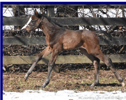
Mosler—Imagistic filly, 3/6. Owned by CLF & Imagistic LLC