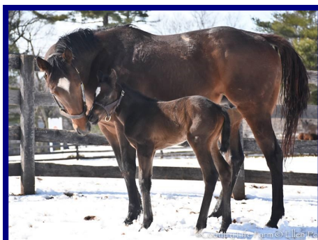
Mosler—Success at Sunup filly, 3/20. Owned by Wes Carter.