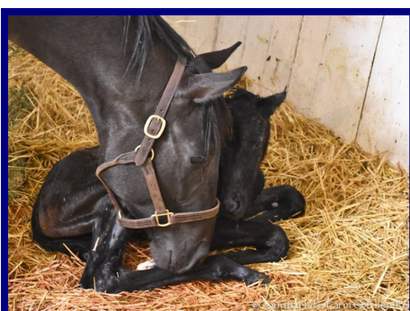
Cairo Prince—Written Request colt, 3/5. Owned by Gainesway Farm.