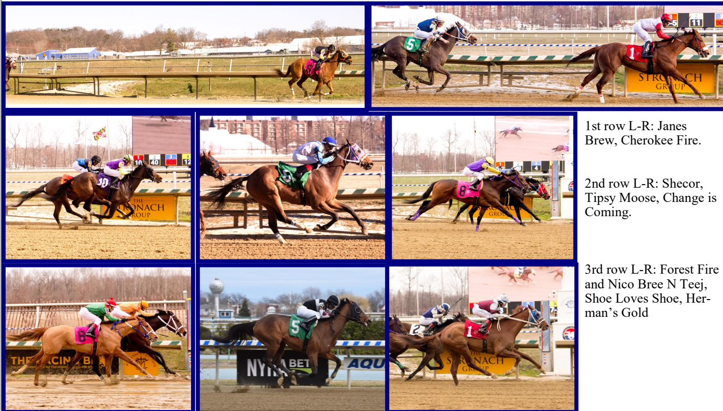
1st row L-R: Janes Brew, Cherokee Fire.