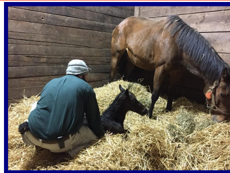
Flatter—Yippee colt; 2/28. Owned by Charles Parker.