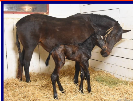
Mosler—Sagamoon filly; 2/2. Owned by Country Life Farm & Sagamoon LLC.