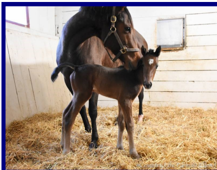
Mosler—Will Do filly; 2/20. Owned by Country Life Farm & Will Do LLC.