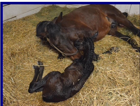
Mosler—Smash Review colt; 2/4. Owned by Country Life Farm.