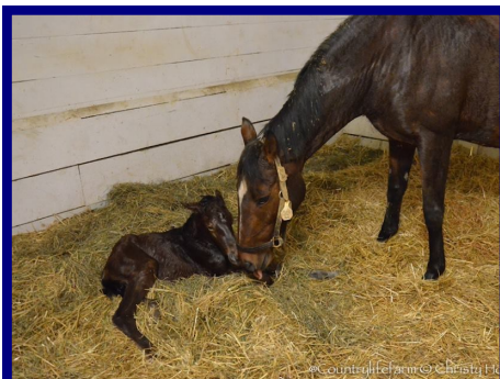
Gio Ponti—Hoping for Sun filly; 2/17. Owned by Walt Vieser.