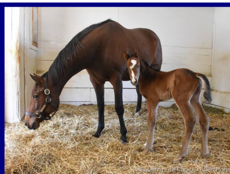
Into Mischief—Tasha's Moon filly; 2/12. Owned by Candyland Farm.