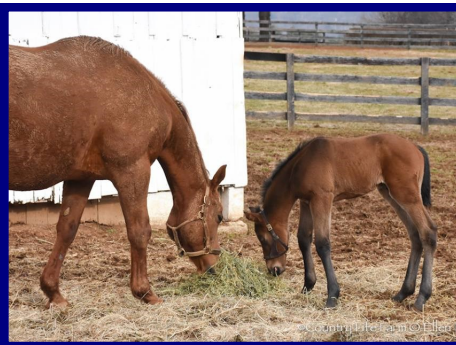
Mosler—All For Fashion colt; 2/9. Owned by Country Life Farm.