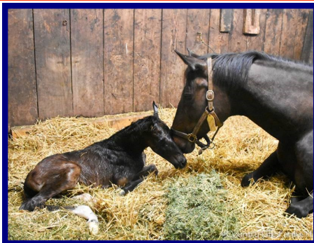
Summer Front—Spring Dance colt; 2/26. Owned by Dave Baxter.