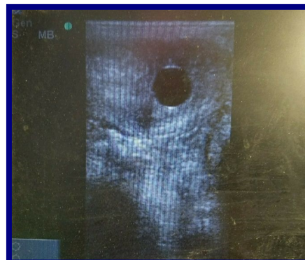
Steel Cut's 14-day pregnancy to Divining Rod.

Other excellent mares in his first book include: Our Fantene, dam of Gr. 3 winner Javerre $490,081; Formalities Aside, dam of SW & $556,593-earner Awesome Flower; SW & $381,650-earner Sticky; and more of the finest mares in the Mid-Atlantic. Preakness-Placed Divining Rod stands for $5,000 LFSN.