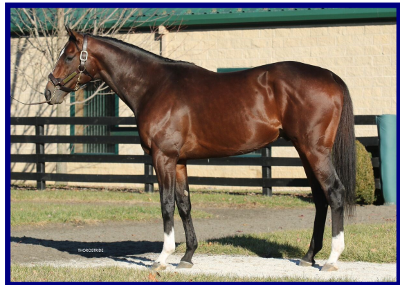
Divining Rod is a beautifully balanced athlete.

Click here to view his video: DIVINING ROD