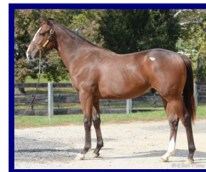
Bodemeister—Raise Up 2016 colt