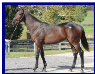
Super Ninety Nine—Arch Enemy 2016 colt