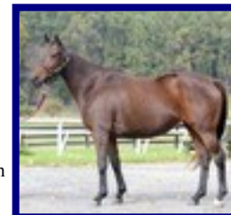
Raise Up In foal to: Carpe Diem