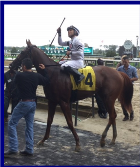
Redhairdon'tcare entering the winner's circle at Belmont after her debut victory.