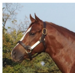
Super Ninety Nine