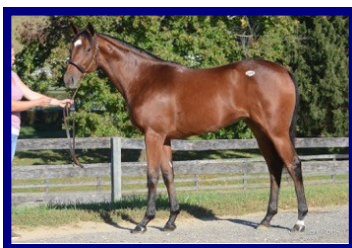
Street Sense—La La's Cookin 2016 filly

Next stop—Keeneland November next week, where we are going to raise the bar and shop for an in-foal mare for our Raise You LLC's who is a notch above what we've done in the past. A mare in the $75,000 range with the pedigree and covering sire power to produce a six-figure MD-bred weanling or yearling for our partners. Think fast, because these popular 2 year-and-out breeding partnerships are in demand!