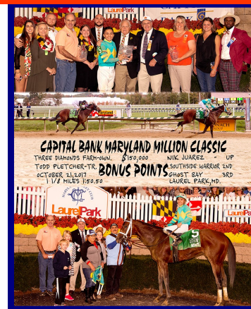
Bonus Points, bred by Country Life Farm and foaled here in 2014, wins the MD Million Classic!

More notable mentions on MD Million Day were Friesan Fire's daughter She Rolls, taking third in the Distaff, Malibu Moon's son Blu Moon Ace (a Merryland training graduate) who won the Sprint, and Merryland training graduate Talk Show Man running third in the Turf Stakes.