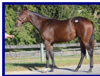
Maclean's Music—Party Girl 2016 filly