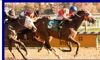
Flash gets to the wire first (above).

Congratulations to all of our partners in the Fire Away LLC!