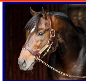
Malibu Moon has 7 entries in Breeders' Cup races this weekend!