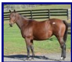
Curio In foal to: Will Take Charge