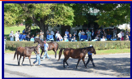
Above: New partnership broodmares Curio, Laura's Moon and Raise Up are shown to the crowd.