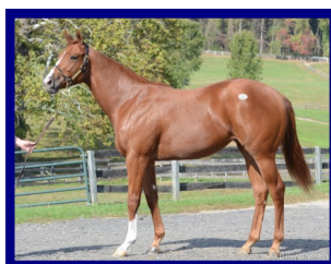
Yes It's True—Lucky Song 2016 filly