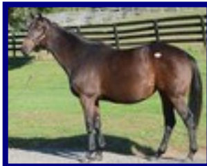
Laura's Moon In foal to: Overanalyze