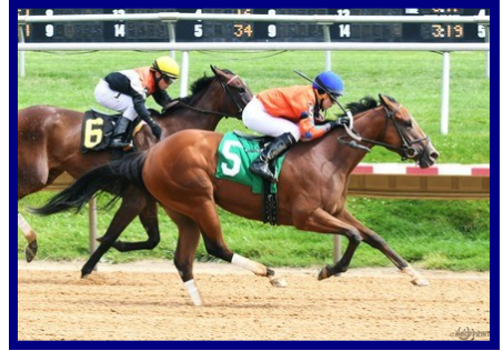
CLF Partnership filly Into Bluegrass won at first asking on 6/24 at Delaware Park!