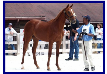
The 11 yearlings we exhibited at the MHBA Yearling Show were (clockwise from top left):