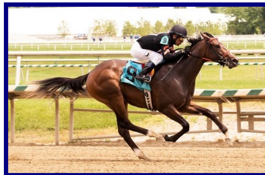
Limited View scores in her debut at Laurel!

The big, beautifully built son of Malibu Moon won the G2 Peter Pan Stakes by 13 lengths. His dam Bandstand (by Deputy Minister), hails from the family of Eclipse Champion Shanghai Bobby and his second dam is G1 winner City Band.