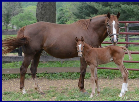
Colt by Friesan Fire out of Scarlett Rah on 4/26. Owned by Smith Farm & Stable.