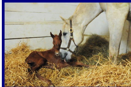
$230,000 Friesan Fire-Duck the Punch filly foaled at Country Life on May 4, 2015.

The OBS Spring Sale of 2-year-olds in Training provided fantastic results for Country Life sires Friesan Fire and first-crop sire Freedom Child. Three MD-bred juveniles, all foaled at Country Life, went through the ring. A chestnut filly by Friesan Fire out of Duck the Punch (bred by Mrs. Glennie Martin and Country Life Farm) brought a final bid of $230,000 after a smokin' 9.4 work on breeze day ( video ). She was purchased by West Point Thoroughbreds and Team D (Tony Dutrow).