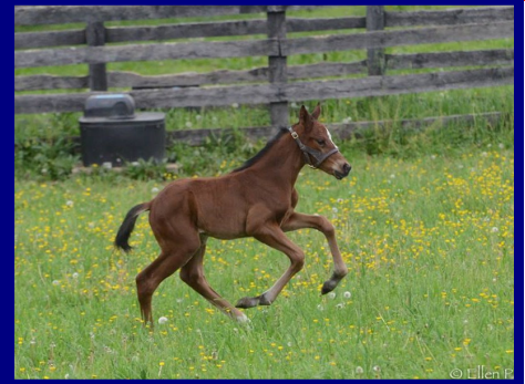
Colt by Gemologist out of Sassy Molly on 4/26. Owned by CLF & a Raise You LLC.