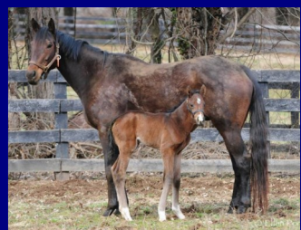
Left: Freedom Child filly out of Minnesota Mafia sold for $55,000.

These three Country Life-sired and foaled juveniles were among the highest-priced Maryland-breds in the sale. This spring/summer should be interesting with more Friesan Fires hitting the track and Freedom Child's first crop entering the starting gates!