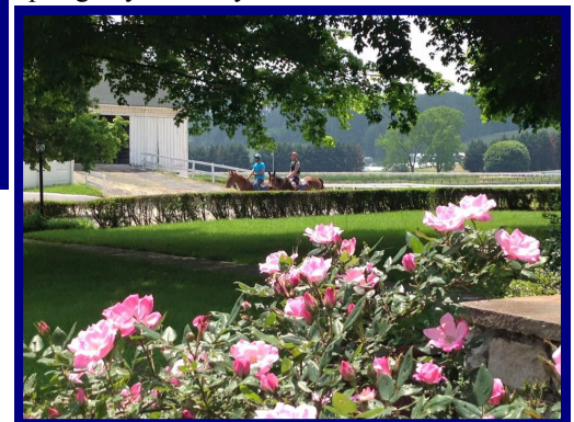
Bottom: Coming off the track on a beautiful spring day at Merryland.