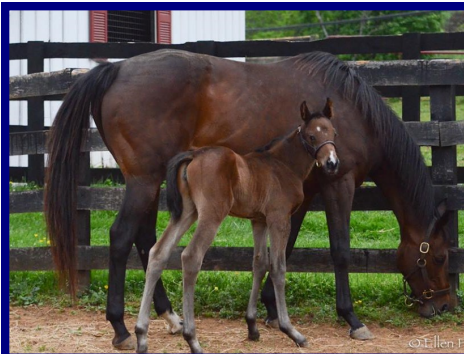
Filly by Take Charge Indy out of Kanani on 4/28. Owned by CLF & a Raise You LLC.