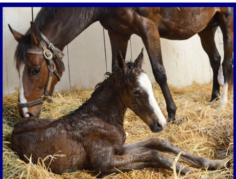
Colt by Super Ninety Nine out of Moon Map on 4/10. Owned by CLF & Moon Map LLC.