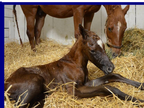
Colt by Race Day out of Brusque on 4/18. Owned by Hector Alcalde.