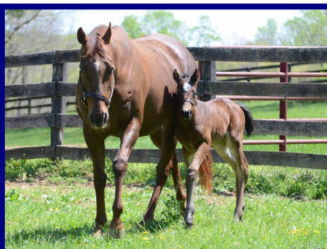
Filly by Golden Lad out of Toasty on 4/15. Owned by Mike Palmer's Dreamtime Stable.