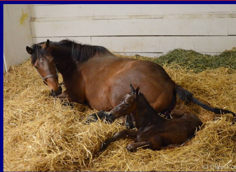
Filly by Twirling Candy out of Miss Moonshine on 4/2. Owned by CLF & Miss Moonshine LLC