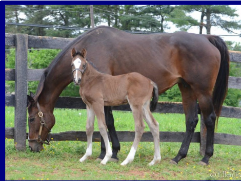
Colt by Orb out of Captive Melody on 4/28. Owned by CLF & a Raise You LLC.