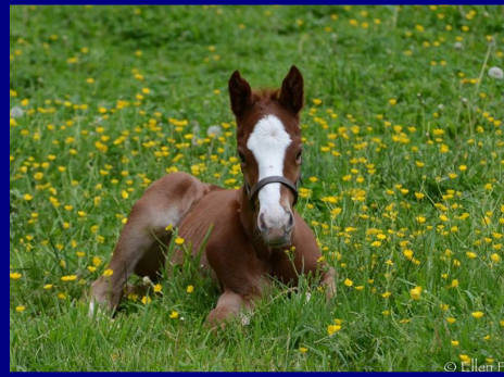
Colt by Golden Lad out of Corinnaise on 4/25. Owned by Candyland Farm.