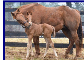
Right: Freedom Child colt out of Final Humor sold for $160,000.