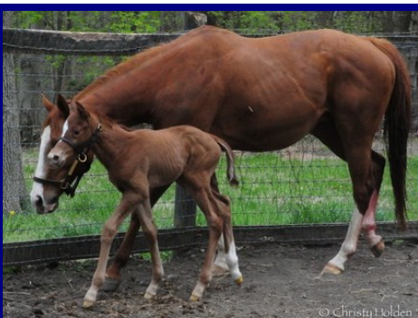
Colt by Orientate out of Grecian Maiden on 4/15. Sadly he passed away at 3 days old.