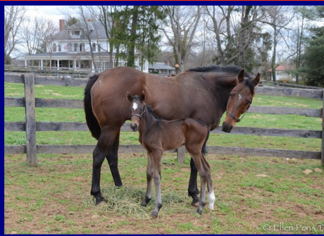
Filly by Imagining out of Shekeepsherbootson on 4/4. Owned by Jim McGreevy.