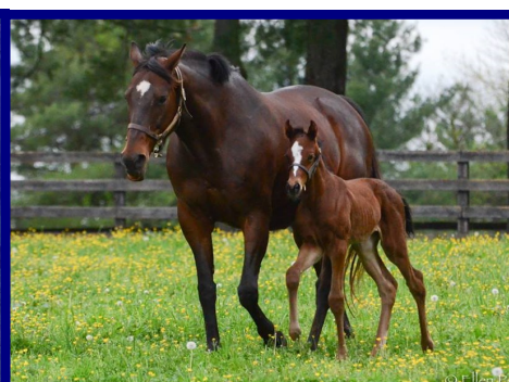
Filly by Super Ninety Nine out of GG's Dolly on 4/24. Owned by Spendthrift Farm.