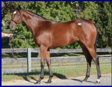
Street Sense—La La's Cookin filly