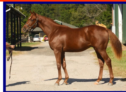
Colt by Super Ninety Nine out of As Long As Ittakes who sold for $45,000.

Another sales highlight was Friesan Fire's colt out of Lotosblume, who brought the highest price of any Mid-Atlantic-sired yearling at $70,000. Zayat Stables made the final bid for the chestnut colt, who is the first foal for the mare and hails from the family of Gr. 2-winner and sire Unbridled Energy and Gr. 3-winner Midnight Cry.