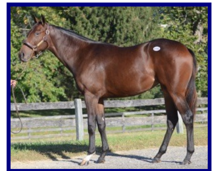
Maclean's Music—Party Girl filly