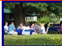
Join us Sunday the 22nd from 11-2 at Merryland!